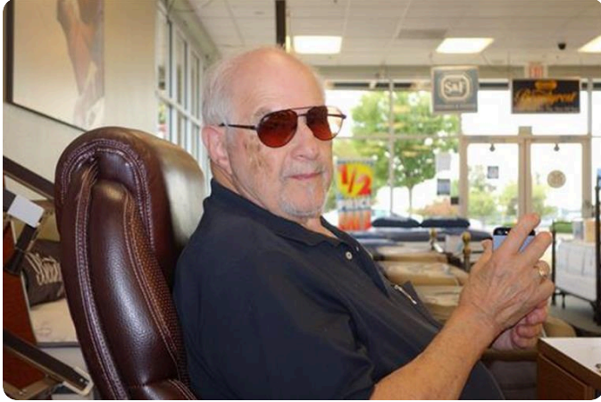
My at Work,